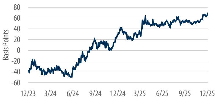
Chart 2: 2-Year/10-Year U.S. Yield Curve

Data from 29/12/23 to 31/12/25. Past performance is no guarantee of future results. The yield spread is the difference between yields on the varying Treasury maturities. A basis point is a common unit of measure for interest rates and is equal to 1/100th of 1% or 0.01%. A 1% change is equal to 100 basis points.