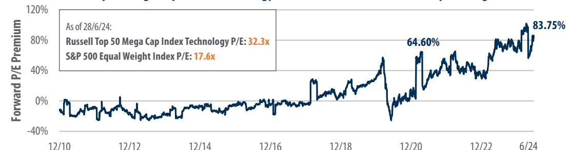
Chart 2: Russell Top 50 Mega Cap Index Technology P/E Premium to the S&P 500 Equal Weight Index

Data from 31/12/10-28/6/24.